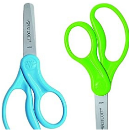
1 Pair of Scissors (Rounded Tip)