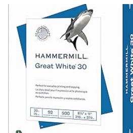
2 Reams of Copy Paper