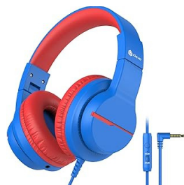
1 Pair of Headphones (No Earbuds)