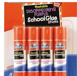
1 Pack of Elmer's Glue Sticks