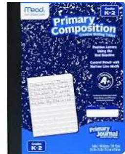
3 Primary Composition Notebooks