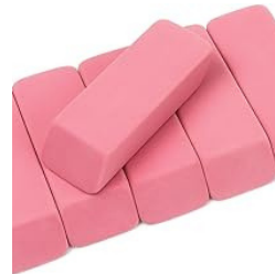
1 Pack of Erasers