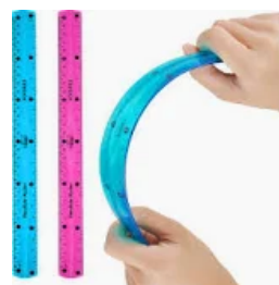
1 Flexible Ruler