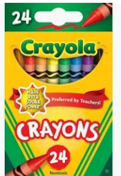
2 Boxes of Crayola Crayons