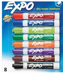
1 Pack of Expo Dry Erase Markers