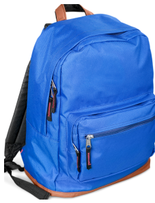
Bookbag (No Wheels)