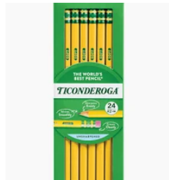
1 Box of 24 Sharpened Ticonderoga Pencils